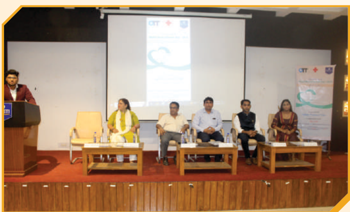
Seeking help is a sign of strength, not weakness. To mark this day Srustians celebrated the World Mental Health Day on 10.10.2023.