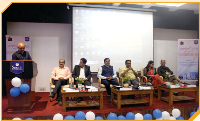
Conduct of Arohan : 2023 - Student Induction Programme of MBA students in Srusti Academy of Management (Autonomous) on 16.09.2023.