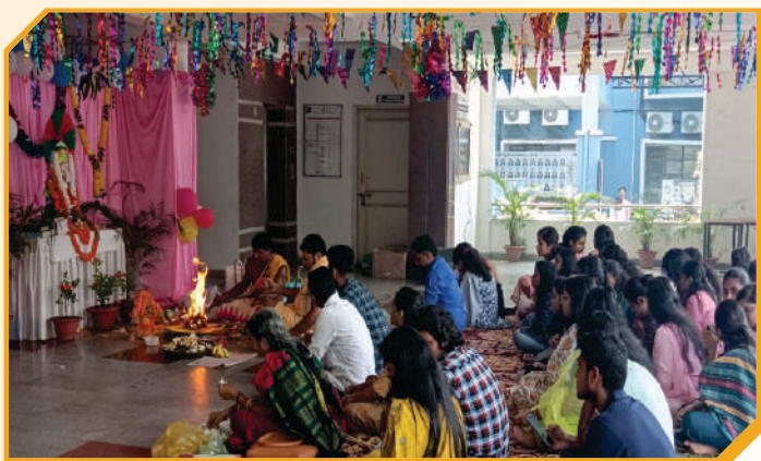
Celebration of Ganesh Puja in the campus of Srusti Academy of Management (Autonomous) on 19.09.2023.