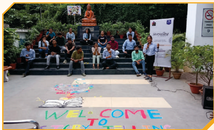
Conduct of Story Telling Session by Eloquence Club in Srusti Academy of Management (Autonomous) on 29.09.2023.