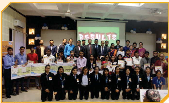
Srusti Academy's Crossfire 2023 : where knowledge, rhythm, and reels collide on 17.12.2023.