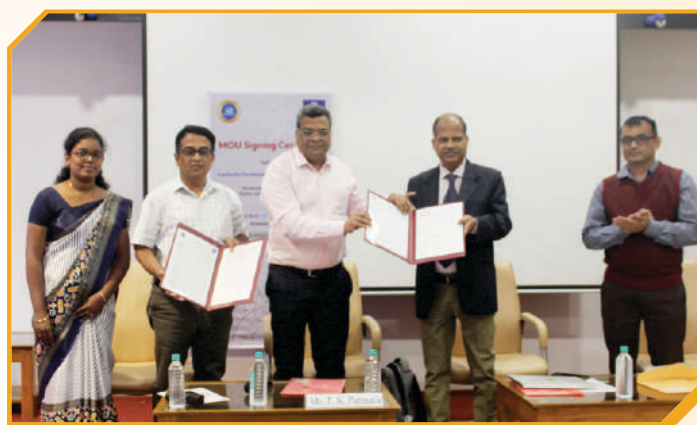
An MOU is signed between Srusti Academy of Management (Autonomous) and CDAC to elevate technological skills on 05.12.2023.