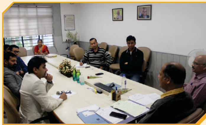
Governing Body Meeting of Srusti Alumni Association on 23.12.2023.