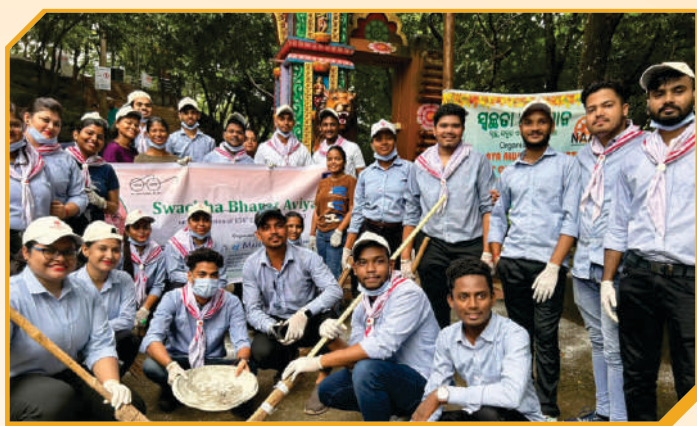
In the Spirit of Bapu, students came together for Swachha Bharat Abhiyan near Shikhar Chandi Temple on 01.10.2023.