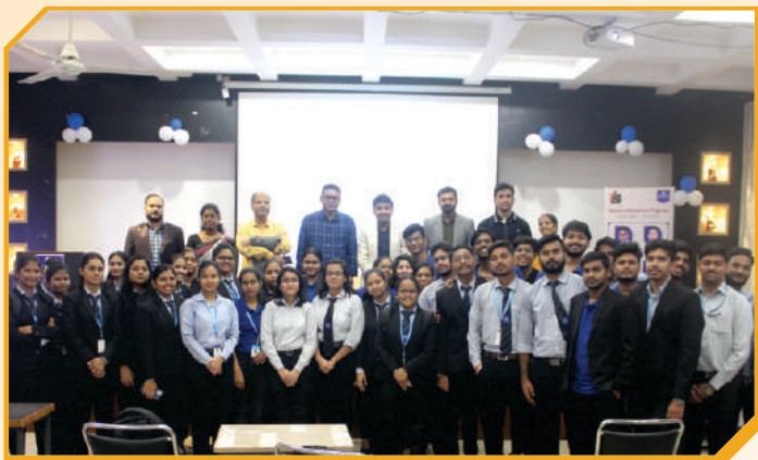
Alumni Interactive Programme on 23.12.2023 where memories meet success.